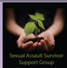
Sexual Assault Survivor Support Group

ToP training is an excellent way to breathe new life into the great work that you do. Creative, interactive and innovative, perfect for practically any setting!